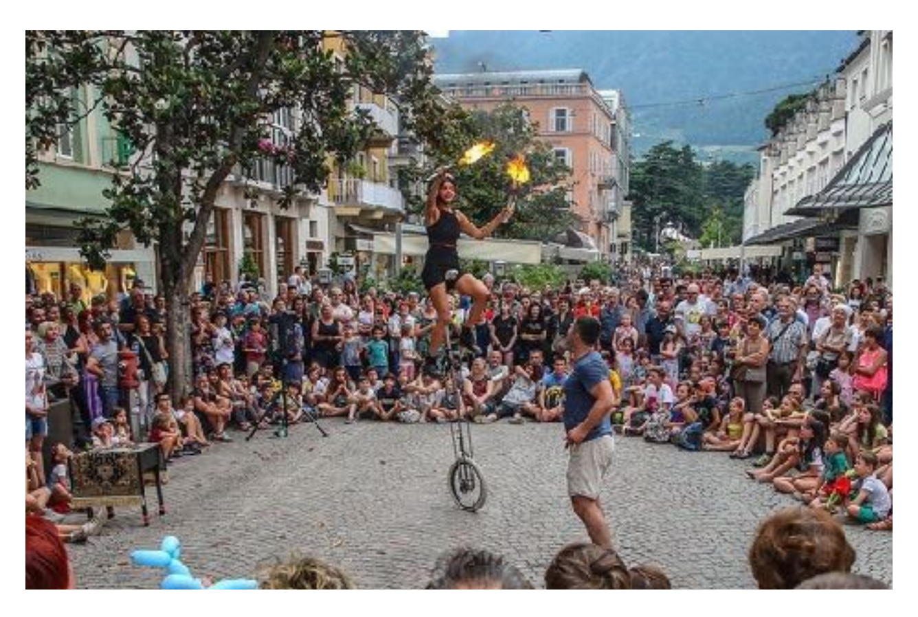
One woman street show!

A sophisticated first lady arrives in the square. She is well dressed, in a black women's suit and hills shoes..she seems unsure, apprehensive about her look.